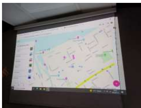
Doing a Scavenger Hunt in Siófok