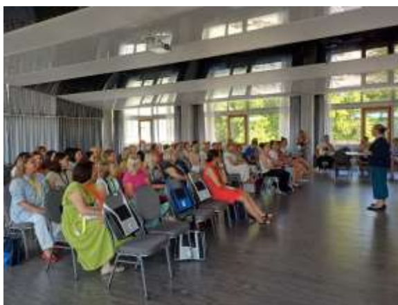
At the opening ceremony in Room Balaton of Sungarden Hotel

familiarized with the location of the Conference Rooms various sessions were held in. Remarkably, timing was one of the main features of this event, the schedule being never violated. Another distinctive feature of this Summer Course was creating new groupings not only each day, but sometimes each session. Thus, there were so many opportunities for the participants to learn about others not only as individuals, but as professionals, their experiences and backgrounds. In addition, ESL teachers were able to develop their teambuilding and intercultural communication skills.