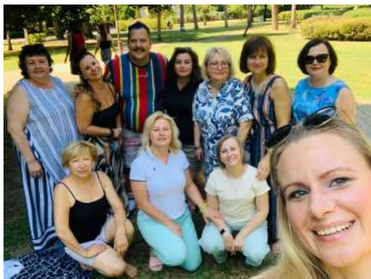
Some participants and facilitators at the outdoor session in the Terkep park

Next session “Silent Books” presented strategies and tools of using various techniques in teaching English. Imagination, critical thinking, creative ways of solving problems are needed to decode a story using pictures, body language or sounds. In addition, the participants had a hands-on experience of creating their own silent books in groups. The final session “Storyboarding” provided a framework for the participants to explore the potential of this tool in ESL. They completed their storyboards individually and after that shared them with others.