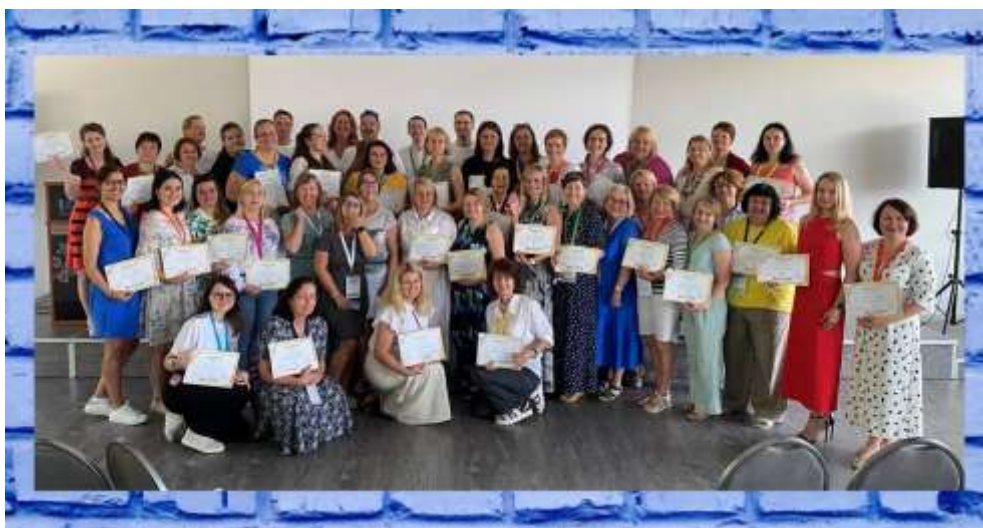
Ukrainian and Hungarian ESL teachers on the completion of the Summer Course “Storytelling with a Purpose” in Siófok, Hungary

This Summer Course “Storytelling with a Purpose” in Siófok, Hungary was special as Ukrainian participants shared their wartime stories with others, spreading the word of what is happening in Ukraine. All the participants had an opportunity to grow professionally, co-operate with like-minded people and recharge their batteries preparing for next academic year.