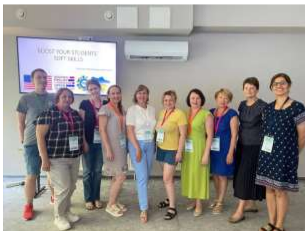
Working in small groups at the sessions

creativity and teambuilding skills. Meanwhile, they continued working on Final Group Projects.